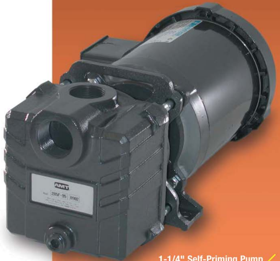
1-1/4" Self-Priming Pump